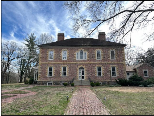
Fairfield-Rocky Mills, site of our 2023 Gala.