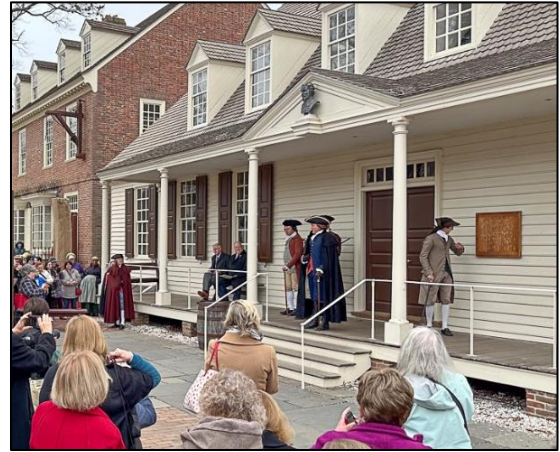
Thomas Jefferson's speech at Raleigh Tavern.