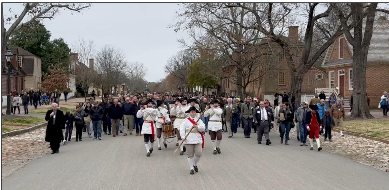
Parade in Colonial Williamsburg to kick off the VA 250 th Celebration on May 12, 2023.